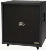
Peavey Windsor 412 Straight Inspired by Peavey® Windsor 4x12 (Straight)