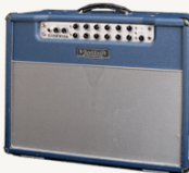
Flathill Texas 212 Combo Inspired by Mesa Boogie® Texas 2x12 (Combo)