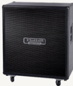
Flathill Studio 412 (BR) Inspired by Mesa Boogie® Studio 4x12 (Bottom-Right Speaker)