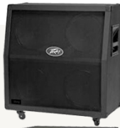
Peavey ValveKing 412 (TR) Inspired by Peavey® ValveKing 4x12 (Top-Right Speaker)