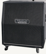
Flathill 412 Angled (BR) Inspired by Mesa Boogie® 4x12 Angled (Bottom-Right Speaker)