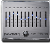
10 Freq EQ Inspired by MXR® M108 Ten Band EQ