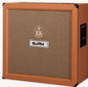
Redhot PPC 412 Inspired by Orange® PPC 4x12