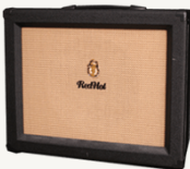
Redhot PPC 112 Inspired by Orange® PPC 1x12