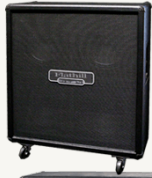
Flathill 412 Inspired by Mesa Boogie® 4x12