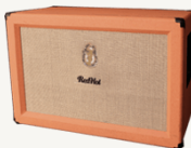
Redhot PPC 212 Inspired by Orange® PPC 2x12