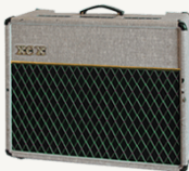
Fox AC30 212 Open Back Inspired by Vox® AC30 2x12 (Open Back)