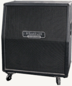
Flathill 412 Angled (TL) Inspired by Mesa Boogie® 4x12 Angled (Top-Left Speaker)