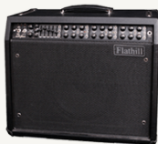
Flathill V Mark 112 Combo Inspired by Mesa Boogie® V Mark 1x12 (Combo)