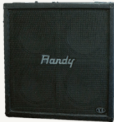
Randy 412 Inspired by Randall® 4x12