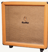
Redhot Vintage 412 (BR) Inspired by Orange® Vintage 4x12 (Bottom Right Speaker)