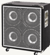
Hangar18 Drive 410 (BR) Inspired by Hartke® 4x10 (Bottom-Right Speaker)