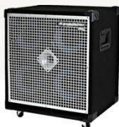
SW Giant 410 Inspired by SWR® Giant 4x10