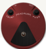
Round Fuzz Inspired by Dunlop® Fuzz Face